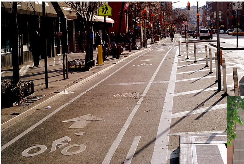
Separated bike lane 9th Avenue, New York New York