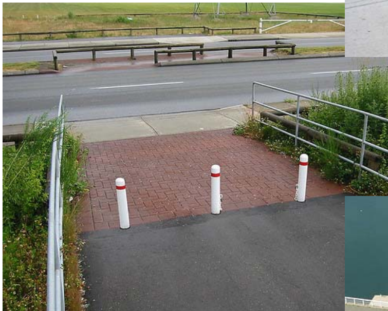
Mid-block crossing, Offset at median