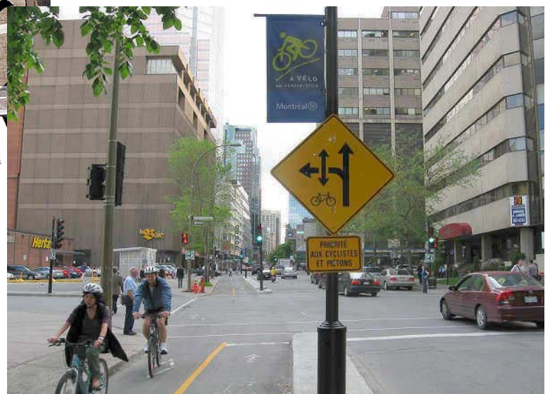
Separated Bike Path Montreal, QC