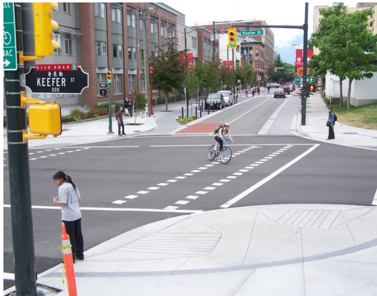
Carrall Street, Downtown Vancouver, BC