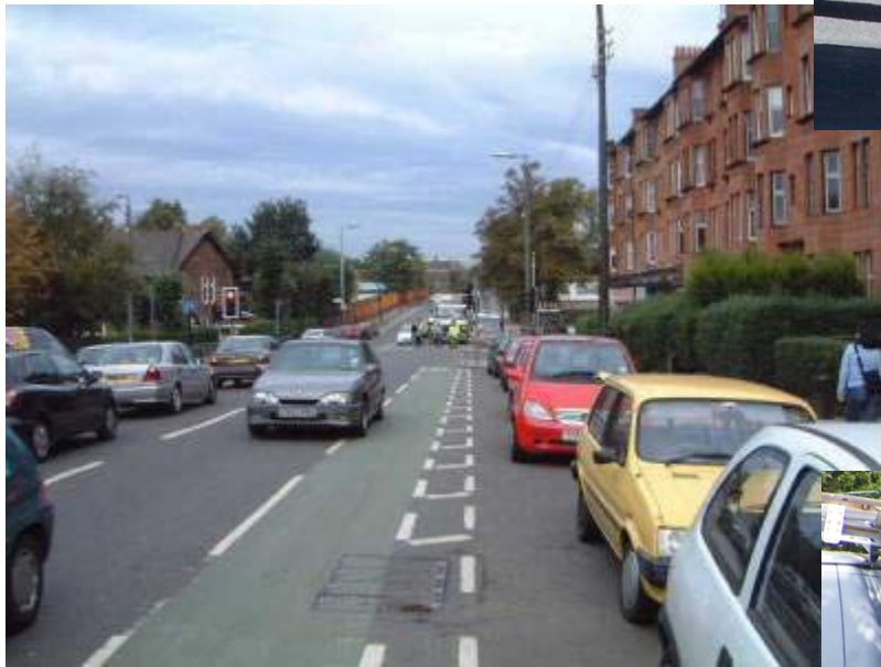
Bike Lane next to Parking Glasgow, Scotland