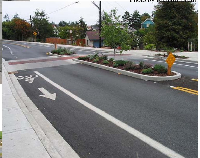
Mid-block Crossing Raised with Medians