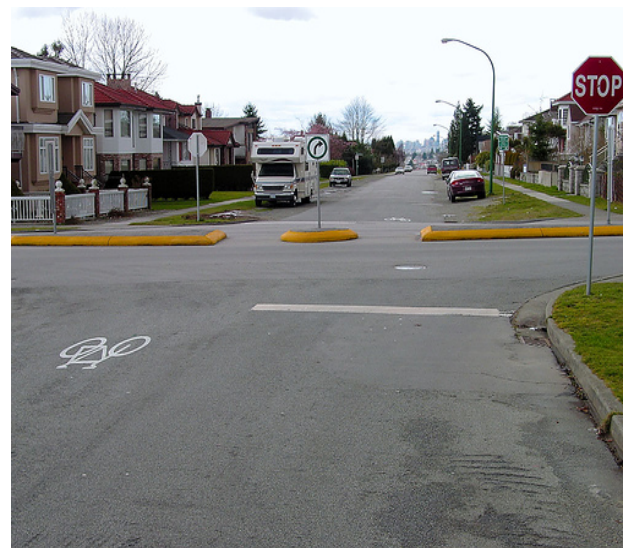
Diverter at crossroads restricts through traffic and left turns