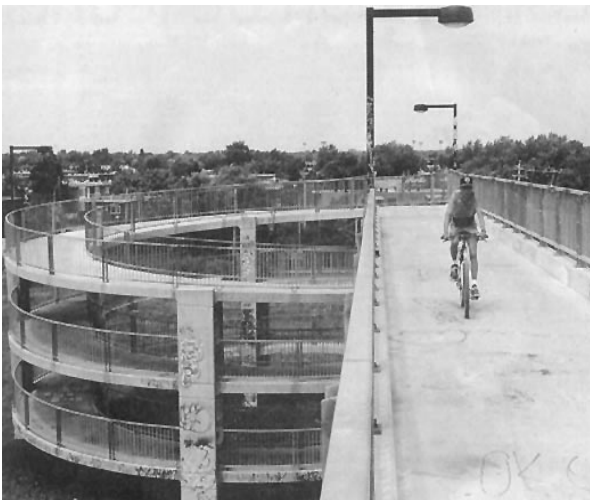
Spiral ramp bridge crosses highway on Route Verte, Quebec