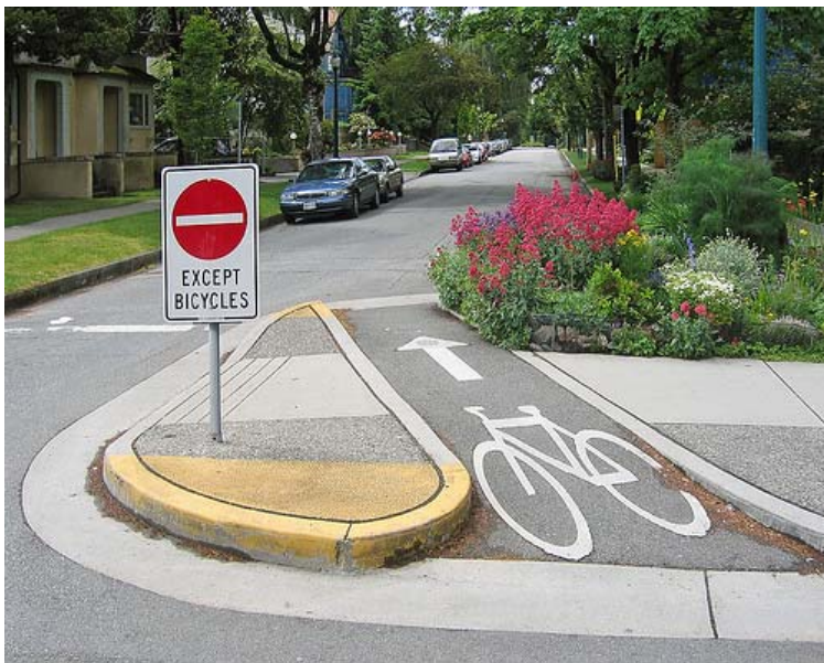
Semi-Diverter prevents through traffic or right turns