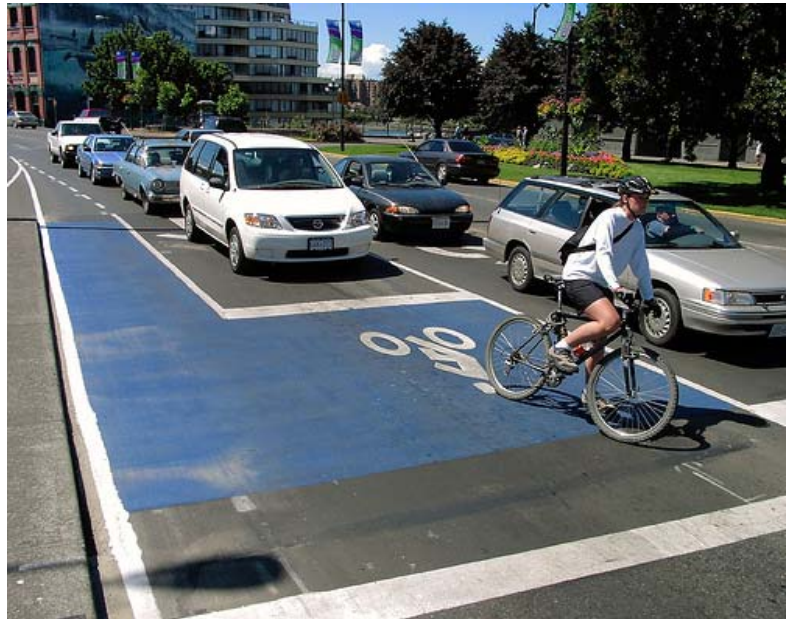
In-Line Bike Box makes left turns easier