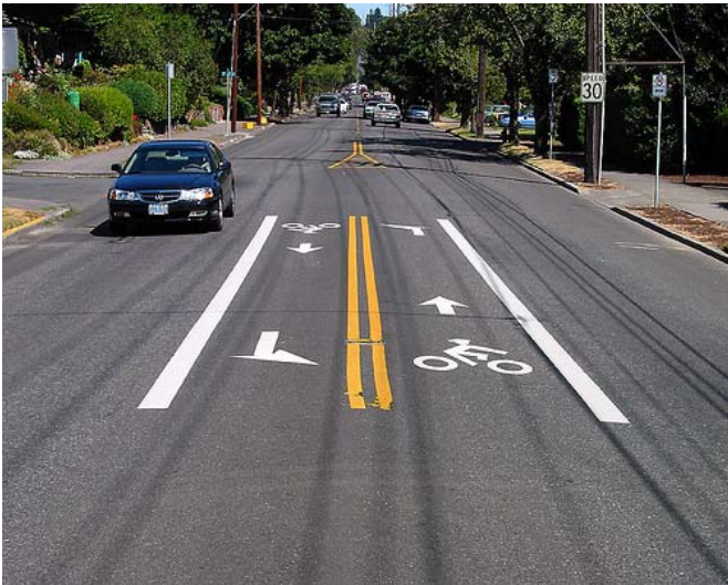
Left turn bike lanes connect bike route along jog in route