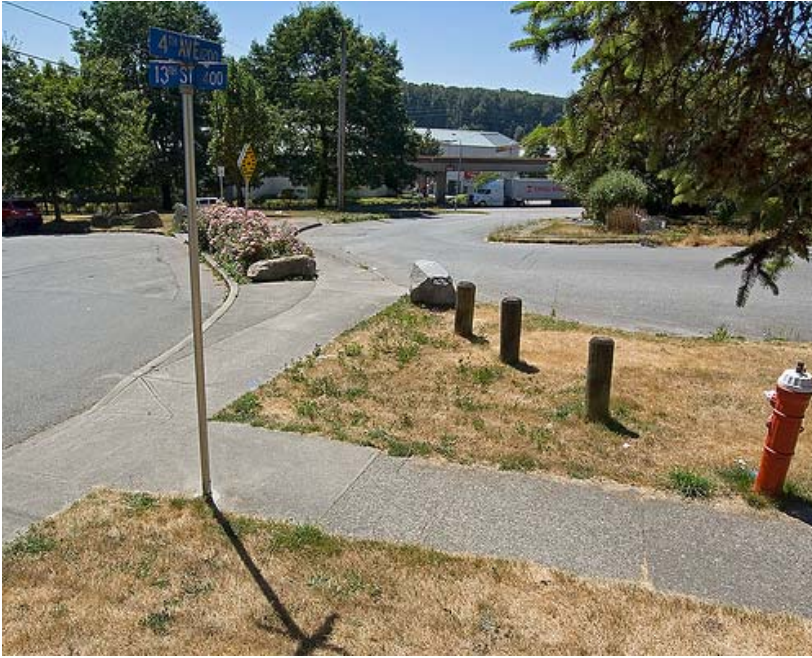
Full diagonal diverter stops through traffic, but allows pedestrians and cyclists to continue

Reducing traffic volume makes a street more comfortable and appealing for cyclists.