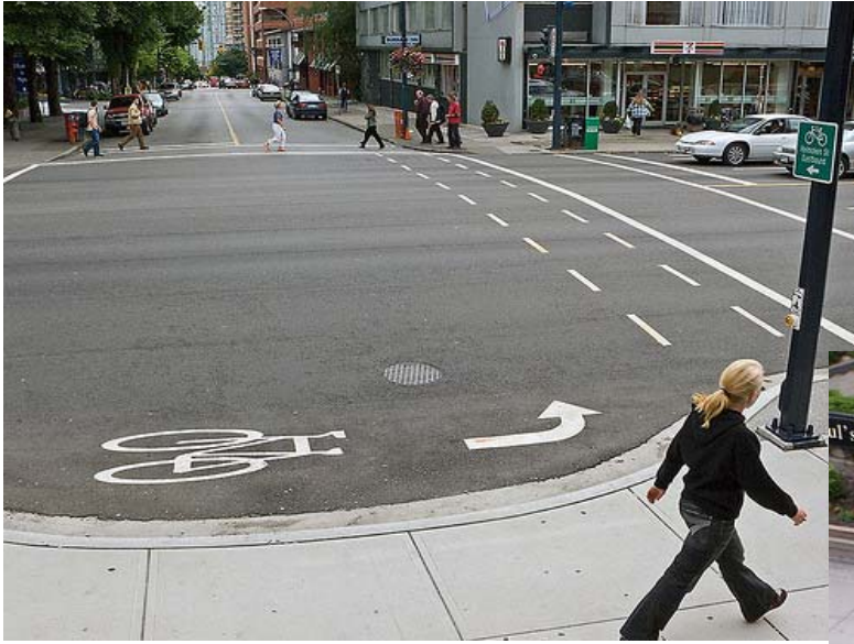
Hook Turn Burrard Street, Vancouver BC