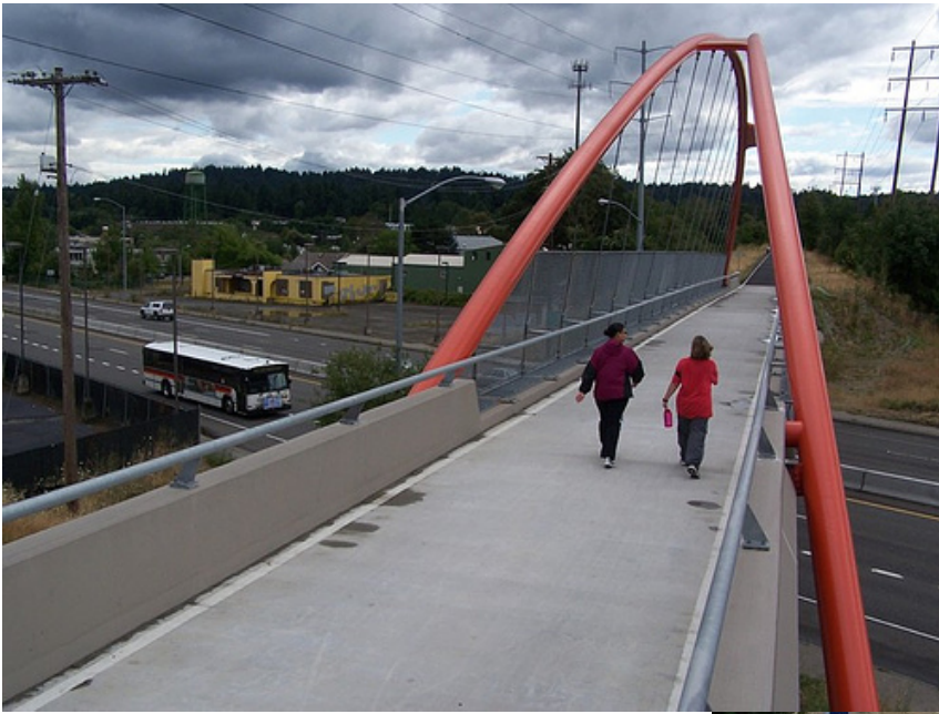
Pedestrian/Bicycle Overpass Portland, Oregon