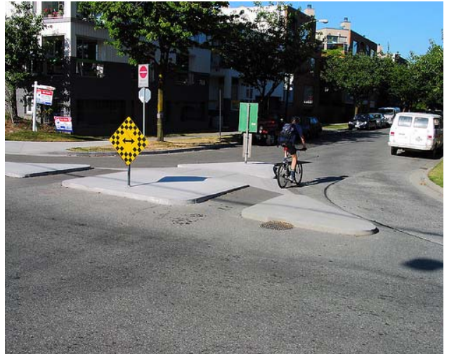
Right turn in, Right turn Out Includes gaps for pedestrians and cyclists