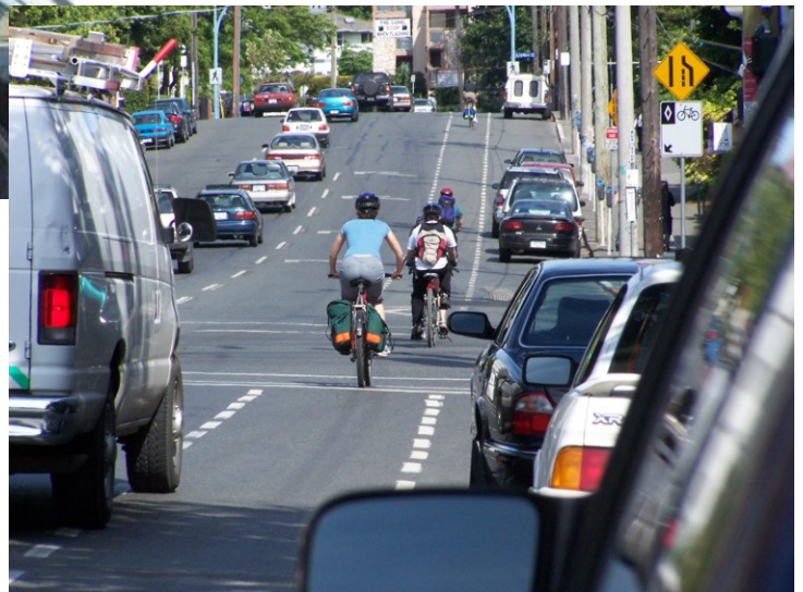
Bike lane next to parking Fort Street, Victoria BC