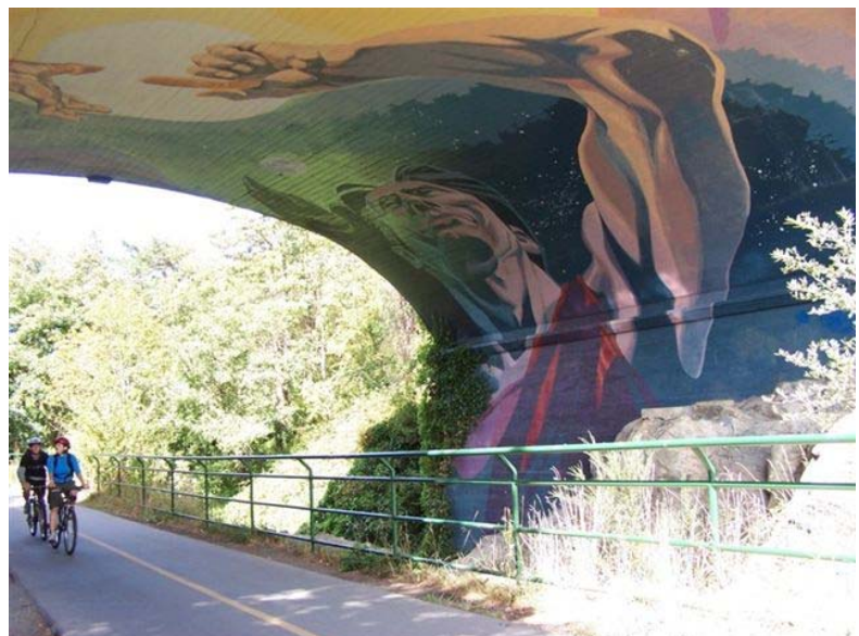
Galloping Goose Trail, Greater Victoria, BC