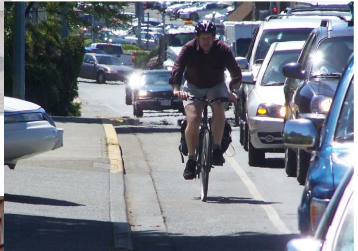
Bike Lane on congested street Finlayson St, Victoria BC