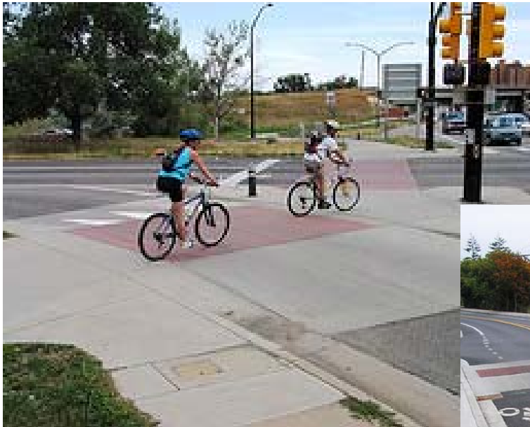
Raised Crossing at yield