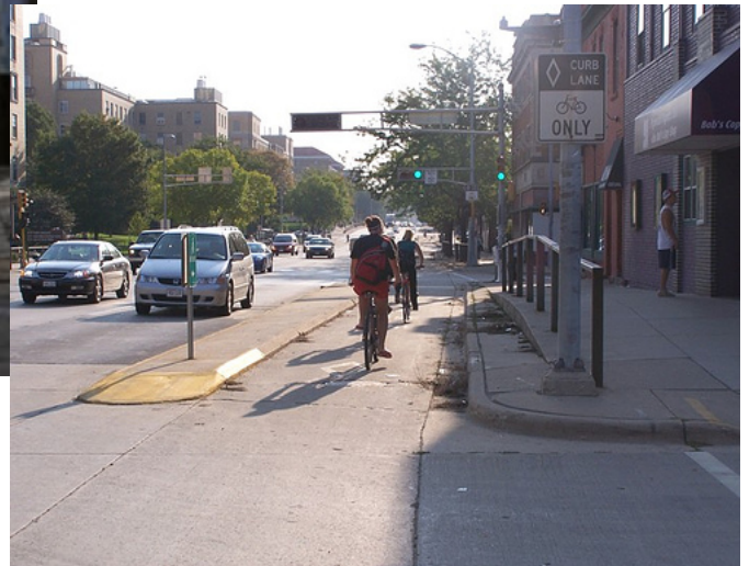
Contra-flow Bike Lane Madison, Wisconsin