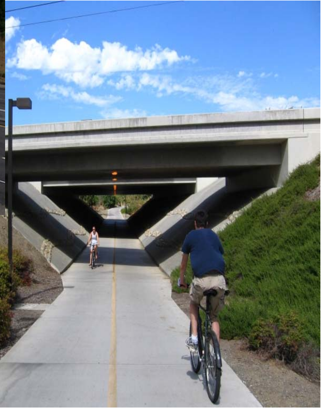
Underpass beneath Arterial Road Davis, California