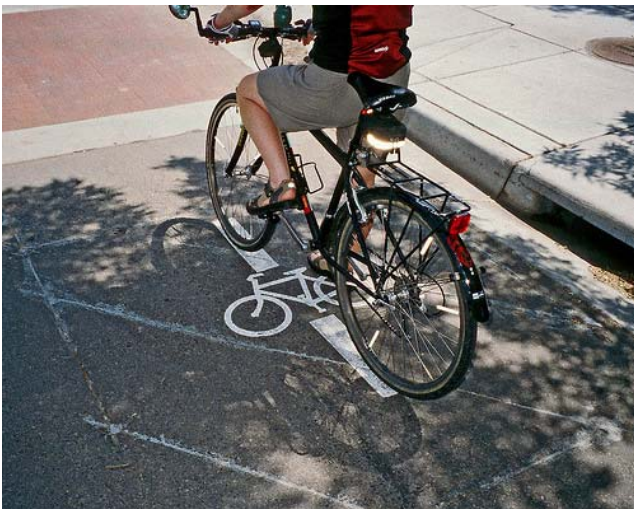
Bike Activated Traffic Signal