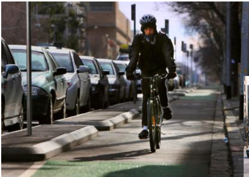
Separated Bike lane next to parking Melbourne, Australia