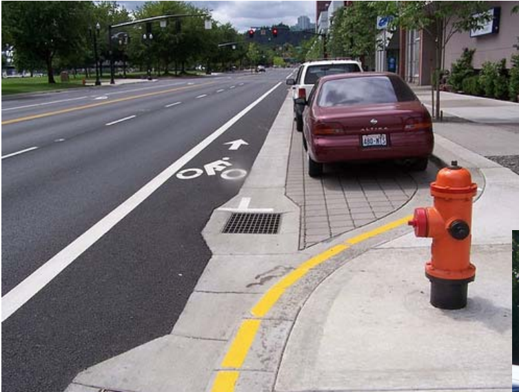
Bike lane next to Parking Naito Parkway, Portland Oregon